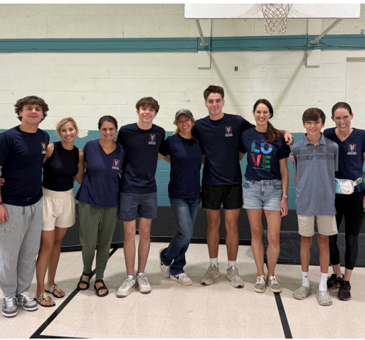
Young Men's Service League

We have been so blessed to have so many wonderful volunteer groups join us on our main campus this spring and summer. Thank you for connecting with our children and enriching their summer experience. We are so honored to highlight our recent volunteer groups: