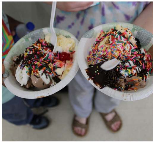
ACF Board Ice Cream Social